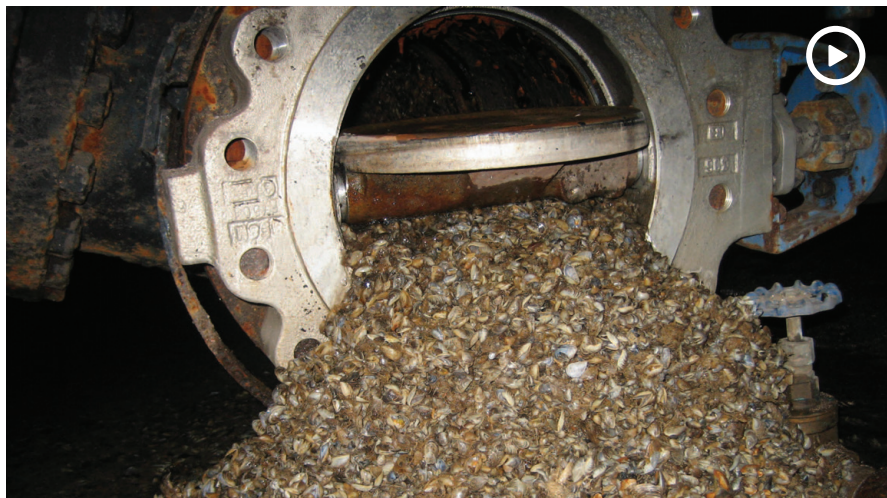
Mussels have infested the penstock belly drain at a Lower Colorado River dam (see video at HydroWorld.com ).

More than 100 coatings and materials for mussel control have been evaluated. During the first year, anti-fouling paints typically used in the marine industry were studied, but they did not prevent mussel attachment in dynamic water conditions. The focus then shifted to finding foul-release coatings that would prevent mussel attachment and demonstrate acceptable durability for Reclamation's specific site conditions. Nineteen materials and coatings, all of which are silicone-based, were found