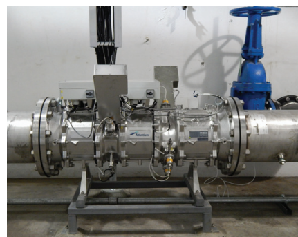
This photo shows an Atlantium Hydro-Optic™ UV system installed at Parker Dam.

In “Monitoring and Control of Macrofouling Mollusks in Fresh Water System,” Gerald Mackie and Renata Claudi posit UV wavelengths between 200 and 400 nanometers inhibit downstream settlement if the veligers were exposed to about 100 millijoules per cm 2 (mJ/cm 2 ). Their data is currently the accepted